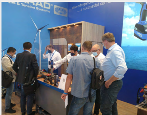
HUSUM WIND 2021

We take this opportunity and would like to thank all visitors at Husum, Gdansk and Bochum. We appreciated the interesting discussions, the valuable exchange, and personal conversations. We also thank all organizers who made these successful exhibitions.