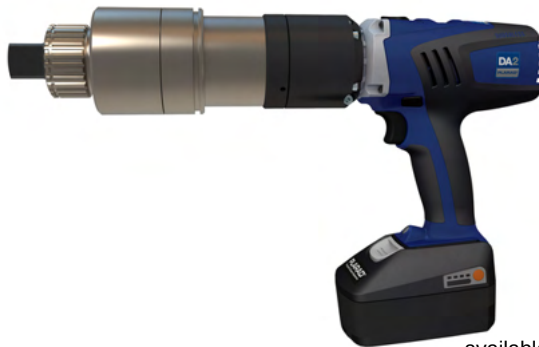
Art.no. - 82114 available up to 2.000 Nm